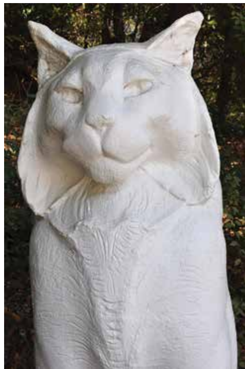
Celebrating life in the Santa Cruz Mountains